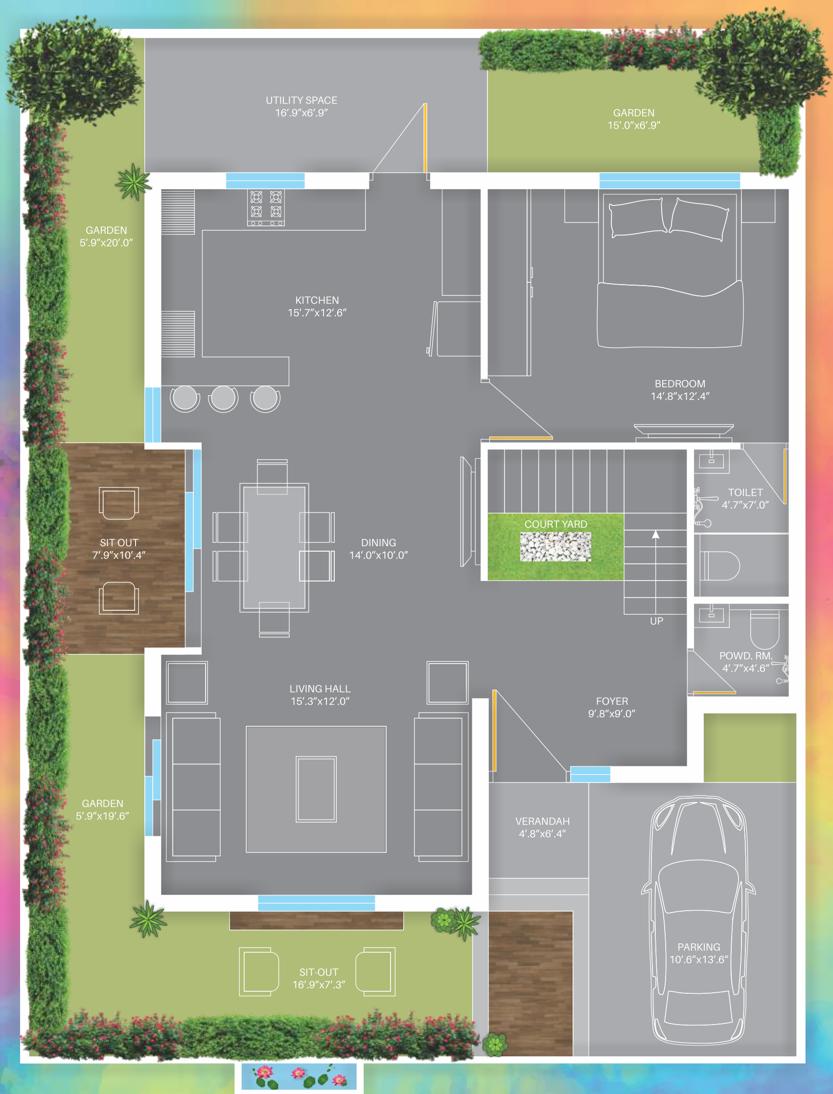
GRAND & GLORIOUS GROUND FLOOR