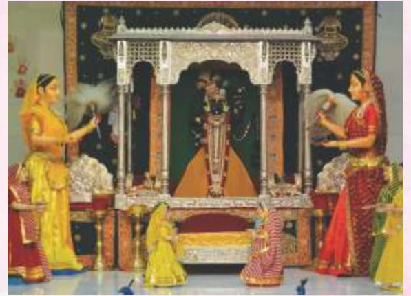
GOVARDHAN NATHJI'S HAVELI

A life so distinguished deserves its share of luxuries. At Shreenathji Varnan, you find it in plenty. Everything you desire is fulfilled at an address that is no less than a marquee of royal lifestyle. Welcome to a world of one-of-a-kind luxuries. Here you find many royal amenities in the most sorted out campus in Vadodara that is all set to redefine luxury living. Golf course spread across acres.