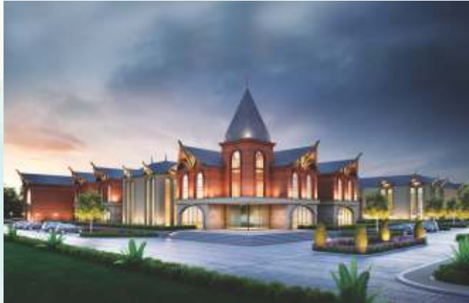
SHREENATHJI 33 CLUB & RESORT